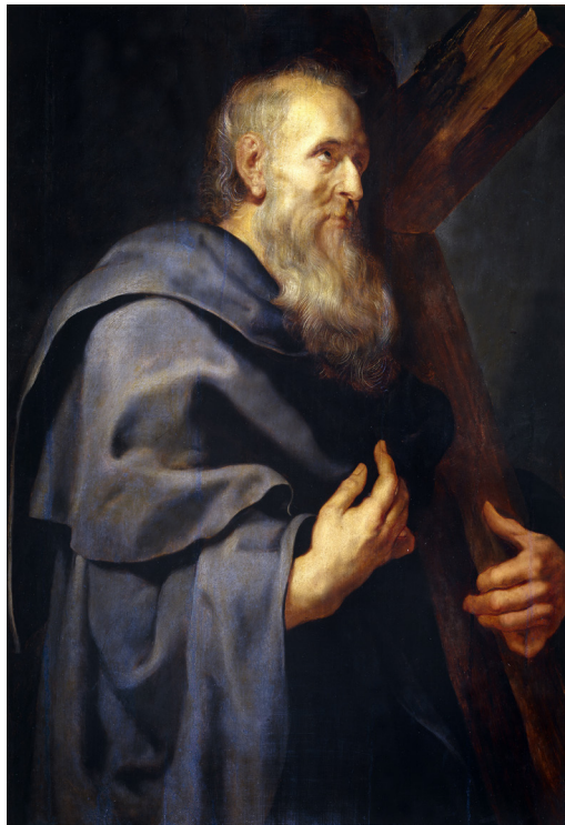
St. Philip by Peter Paul Rubens

St. Philip the Apostle is mentioned in the Bible mostly in the Gospel of John. It is likely that he was a follower of John the Baptist and present when John said of Jesus, “Behold the Lamb of God.” His call came shortly afterward, when Jesus encountered him while returning to Galilee from the Jordan Valley. St. Philip died a martyr’s death, but we’re unsure of the place or date.