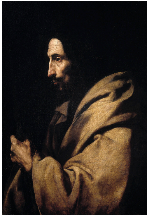
St. Jude Thaddeus by Jusepe de Ribera

St. Judas Thaddeus, brother of St. James the Lesser, was related to Our Lord. He wrote the book of Jude in the New Testament and was martyred in Persia by being beaten with a club.