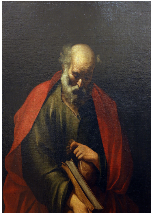
St. Matthias by Jusepe de Ribera

Saint Matthias was a close disciple of Jesus from the time of his Baptism to His Ascension. After Jesus' Ascension, Matthias was the disciple chosen by the Apostles to replace Judas as the twelfth Apostle. He died a martyr's death, possibly by being stoned and then beheaded.