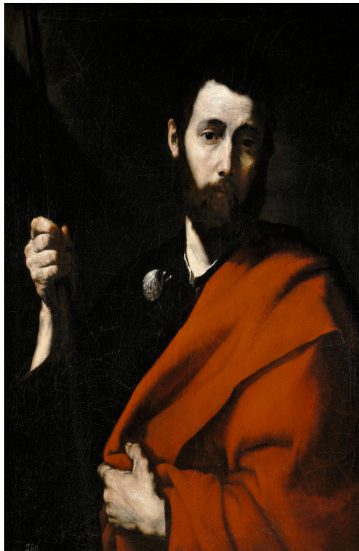
St. James the Greater by Jusepe de Ribera

Saint James was one of Jesus' first Apostles. St. James was a fisherman who, with his brother the Apostle John, worked in their father Zebedee's business. He was martyred around 44 A.D.