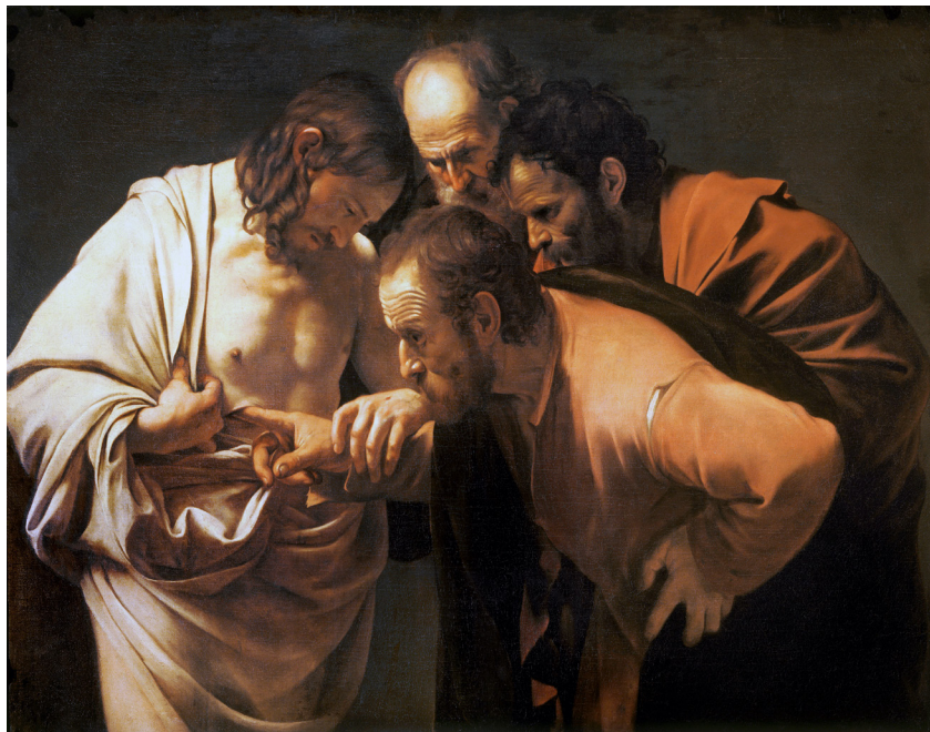
The Doubting of St. Thomas by Caravaggio

St. Thomas is upheld as an example of faith in our Lord despite his seeking of certainty and the doubts that he had – particularly having heard, but not seen, that Jesus had risen from the dead. In spite of his earlier doubts, he gave his life for the faith. It is believed that St. Thomas was martyred with a spear in India. Today the Catholic and Orthodox faithful descended from the first Indian believers are known as St. Thomas Christians.