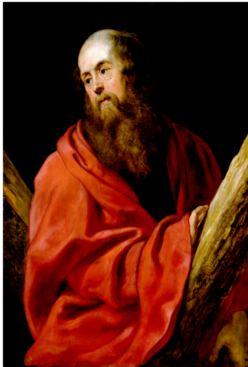
St. Andrew by Peter Paul Rubens

Saint Andrew was the brother of Saint Peter. Like his brother, Andrew was a fisherman. In 60 or 62 A.D., Andrew was martyred in Greece on an X-shaped cross.