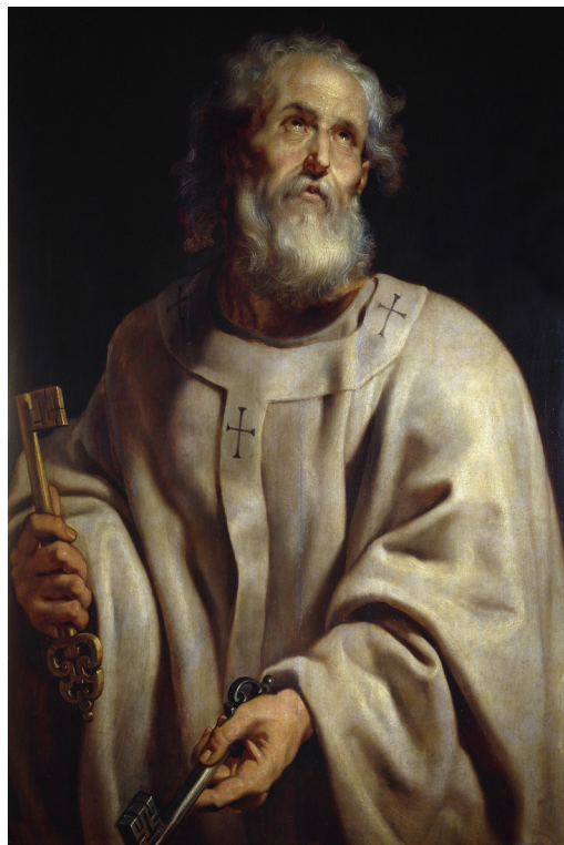
St. Peter Holding the Keys by Peter Paul Rubens

Saint Peter, the chief of the Apostles, is the Rock upon which Christ built His Church. Ever since Peter served as the first pope, there has been an unbroken transmission of spiritual authority to Peter's successors in Rome. Saint Peter was crucified in Nero's Circus on Vatican Hill, sometime between 64 and 68 A.D.