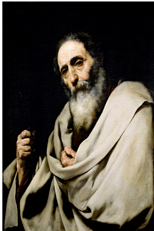
Saint Bartholomew by Jusepe de Ribera

Though we don't know many details of the life of St. Bartholomew, he was likely of Hebrew descent. Some believe that he evangelized India after Jesus' Ascension into Heaven. According to tradition, St. Bartholomew was martyred in Armenia.