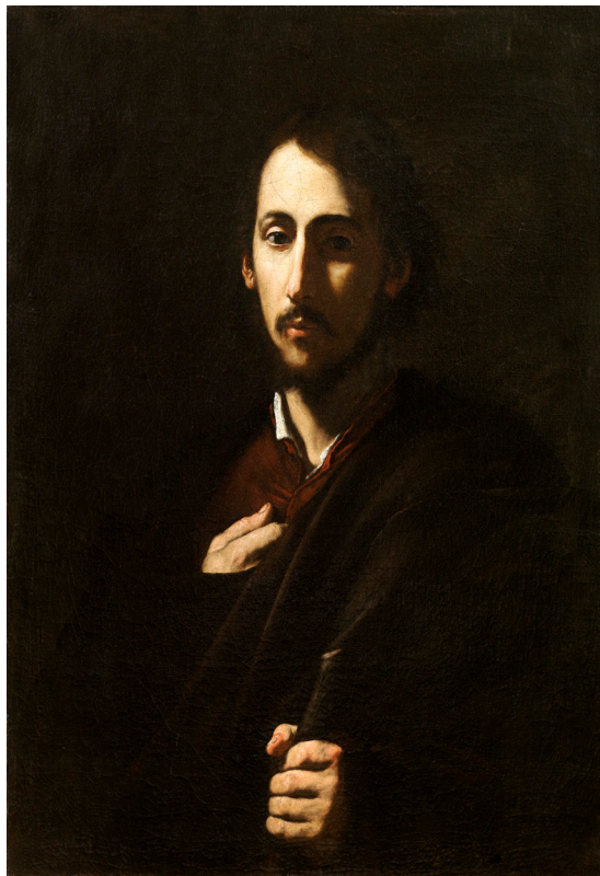
St. James the Lesser by Jusepe de Ribera

St. James the Lesser was the brother of the Apostle Jude and a son of Alphaeus. There are differing views about the reason he was called “lesser.” Some think it was because he was called by Jesus after James the Greater. Others think that he was shorter in height. It is believed that he wrote the letter of James in the New Testament and, having served as the first bishop of Jerusalem, was stoned to death for his faith in Christ.