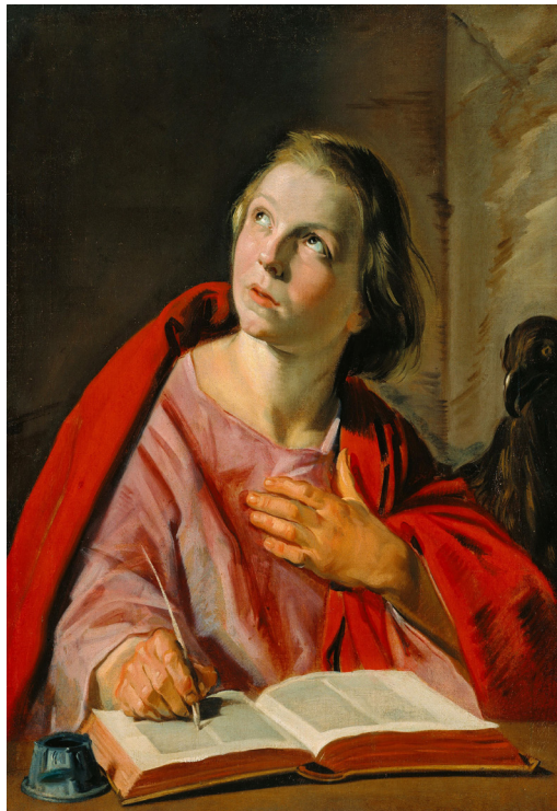
St. John the Evangelist by Frans Hals

Saint John, the “beloved disciple,” was in a small group of Apostles, along with Peter and James (John’s brother), who witnessed the raising of Jairus’ daughter, the Transfiguration, and the events in the Garden of Gethsemane the night before Our Lord’s Passion. Saint John was the only Apostle present at the Crucifixion, and this is where Jesus asked him to care for the Blessed Virgin. St. John is the only Apostle who did not die a martyr’s death, dying in Ephesus about 100 A.D.